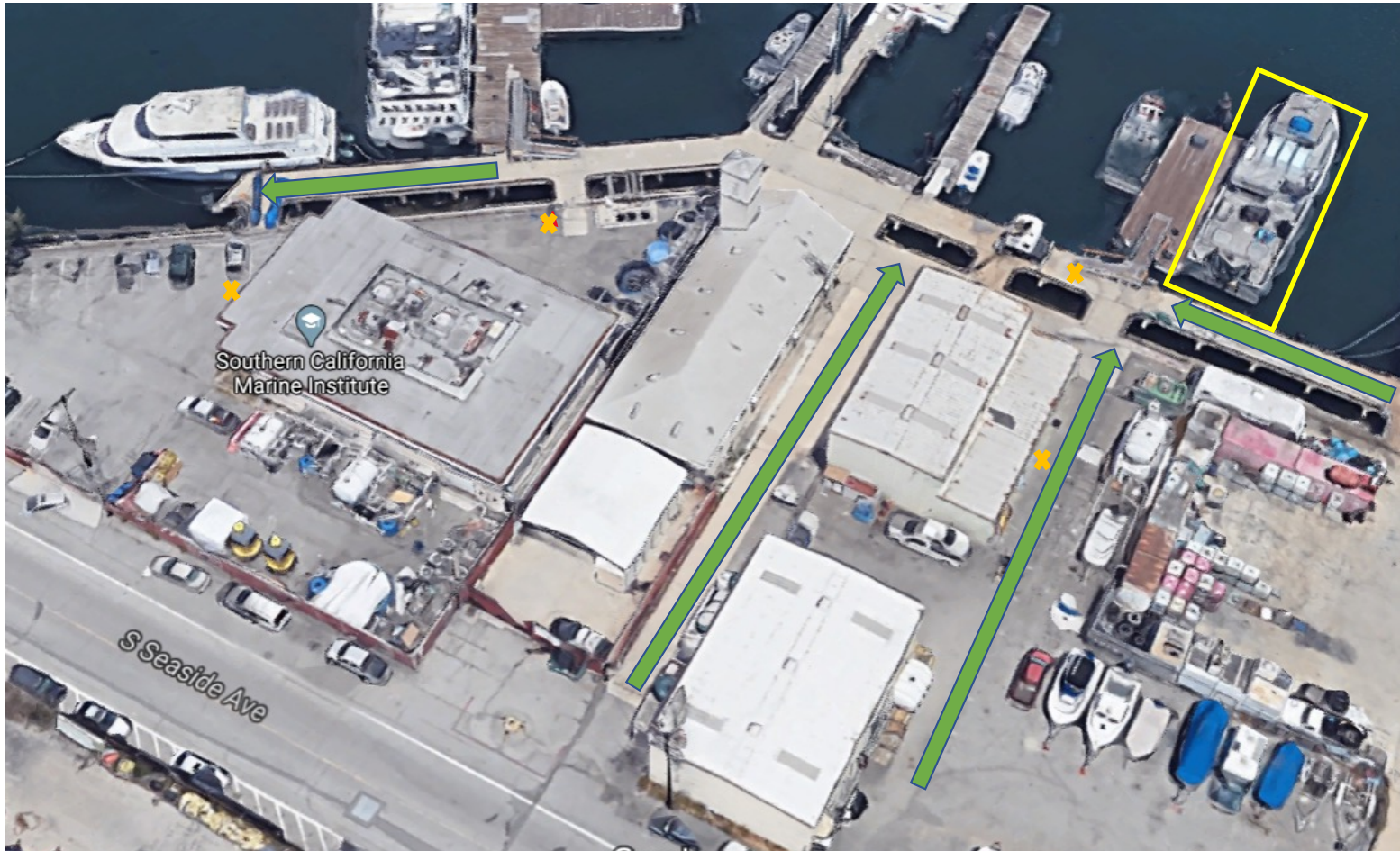
Vessel and line up zone locations